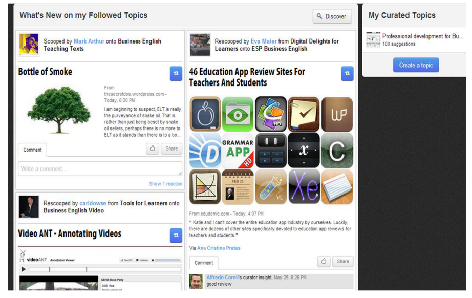
Figure 1: Screenshot of the author's followed topics on Scoop.it account

added to a bookmark bar, and which "helps users publish interesting content directly from their browser to their topic" (<u>http://feedback.scoop.it/knowledgebase/articles/32096-1-6-1-how-to-install-the-bookmarklet-</u>). Since this platform is connected with other social networks, teachers can share their scoops simultaneously on Facebook, Twitter, Linkedin, Tumblr, WordPress and other accounts, and as a result, become more visible in the virtual environment.